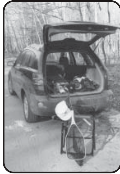
An upside-down day; snow in Massachusetts, but not in NH. An expert on the Blackwater in E. Andover, but no fish. November 2005.