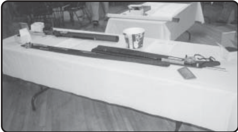
The Grand Raffle Prize at the 03/20/05 GBTU PastaFest is an exquisite rod, reel and line outfit. Come, eat, take a chance, take great stuff home!