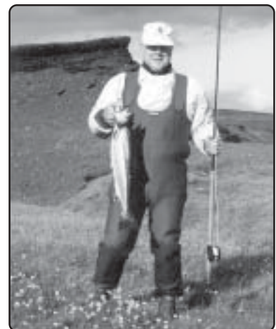
1999 Salmon triumph. East Ranga River, Iceland