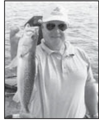
The verdict is in ... Redfish!